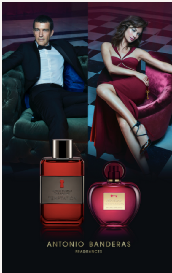
Antonio Banderas