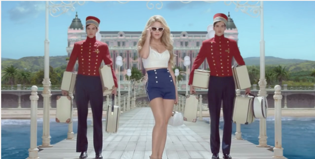
Costa Cruceros - Shakira Jaume de la Iguana - La Iguana