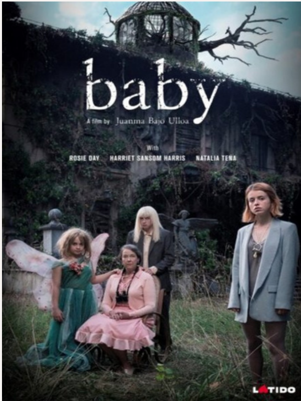
Baby Teaser - Juanma Bajo Ulloa