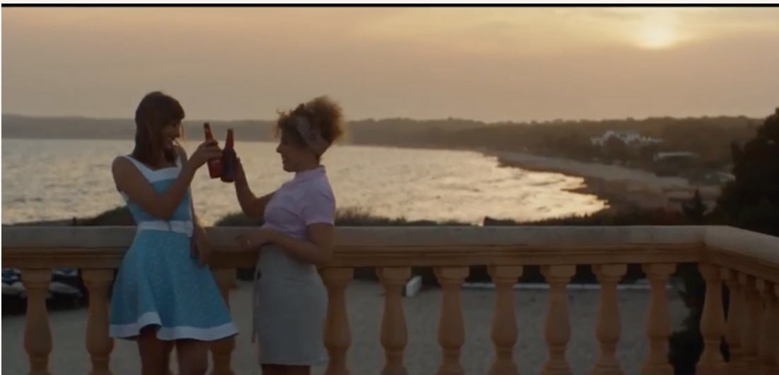
ESTRELLA DAMM - Director CLAUDIA LLOSA Production Company: MILLENNIALS