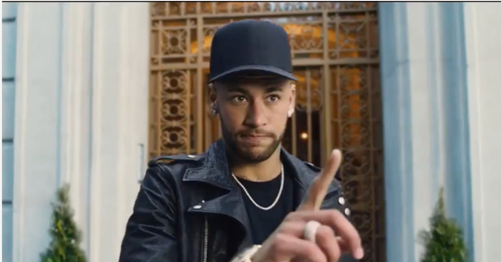
Mastercard - Neymar Rodrigo Saavedra - Landia Films